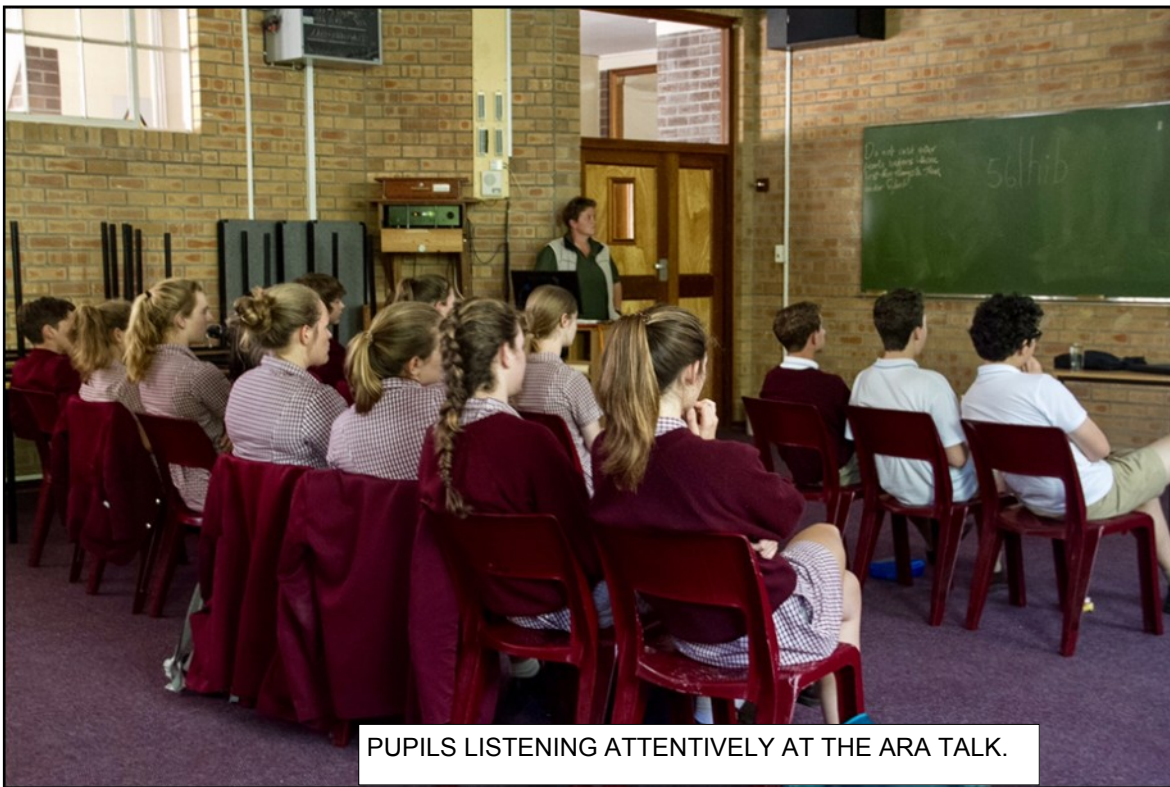
PUPILS LISTENING ATTENTIVELY AT THE ARA TALK.