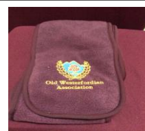
The OW scarf is R80